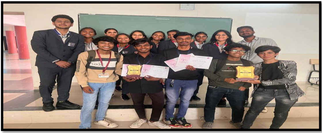
SRIMCA -MBA - Uka Tarsadia University