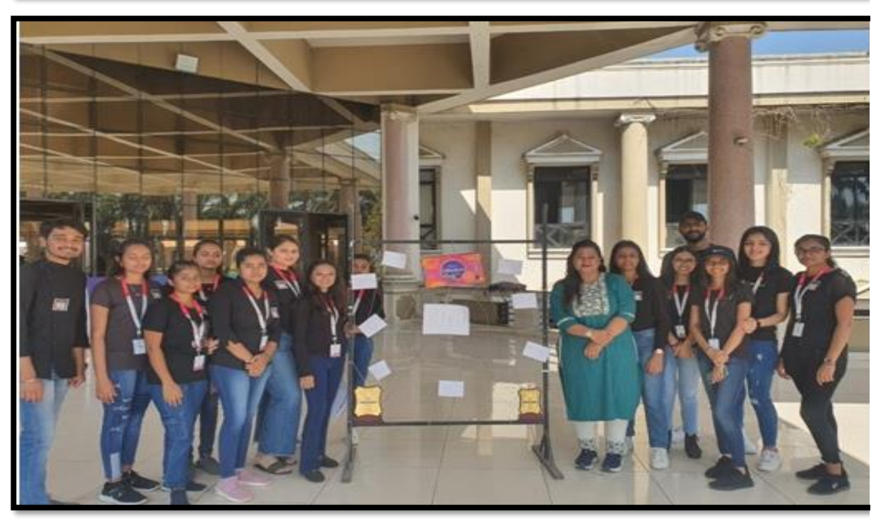
SRIMCA –MBA – Uka Tarsadia University